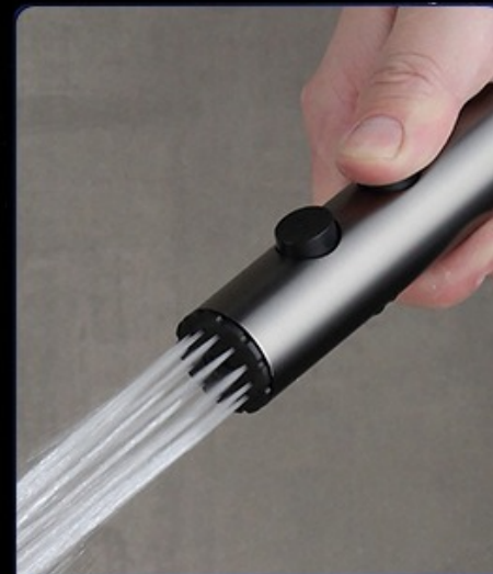
Pressurized flushing mode