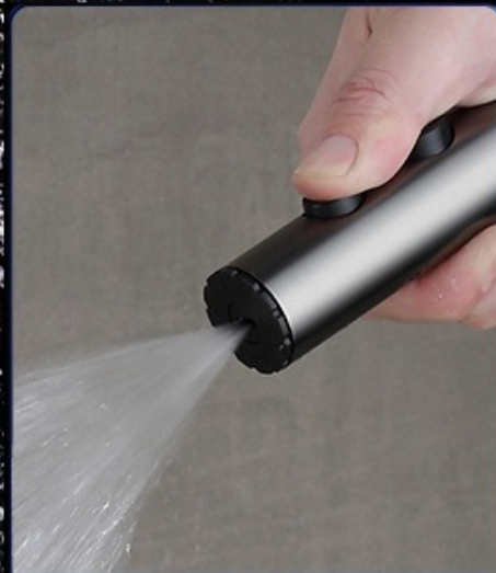
Fan-shaped scraping mode